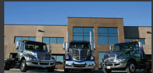
Tilt Deck Division Units