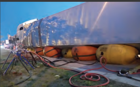
Peat Moss Air Cushion Uprighting