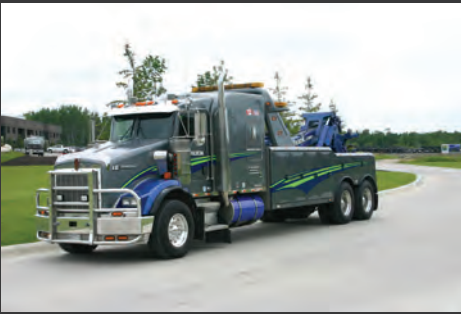
1 Of 13 Heavy Tow Units