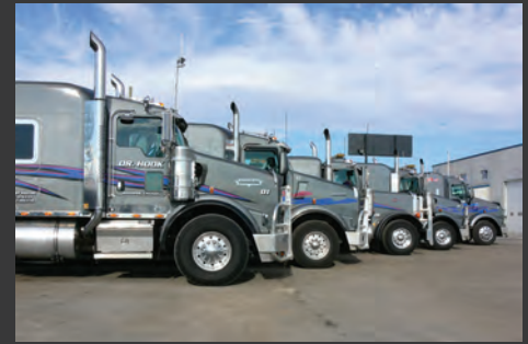
5 Of Our Best Heavy Tow Units