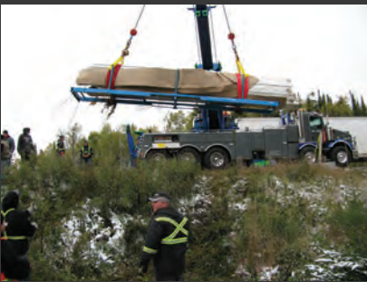
Cargo Recovery From Ravine