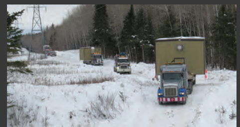
Winter Road Convoy