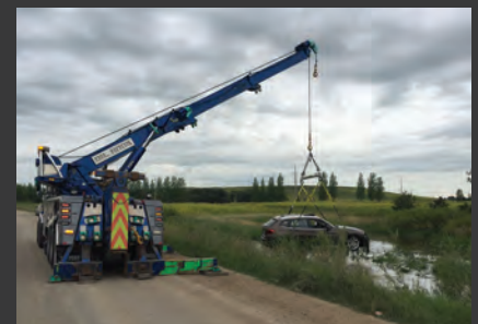
Rotator Fishing Once Again