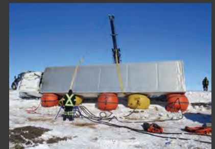
Winter Air Cushion Recovery