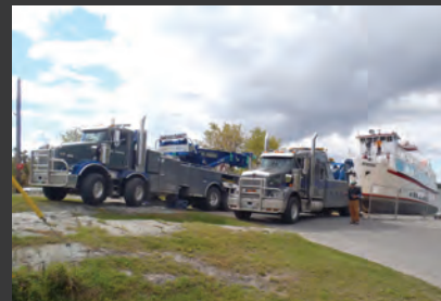
MS Kenora Inspection Winch Out