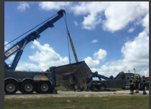
Rotator Upright of Gravel Truck and Trailer