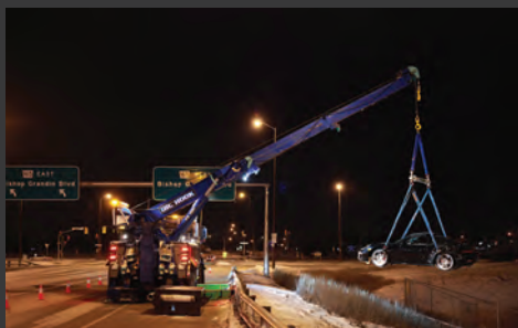
Porsche Off Road Recovery