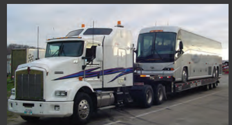
Motor Coach Transport