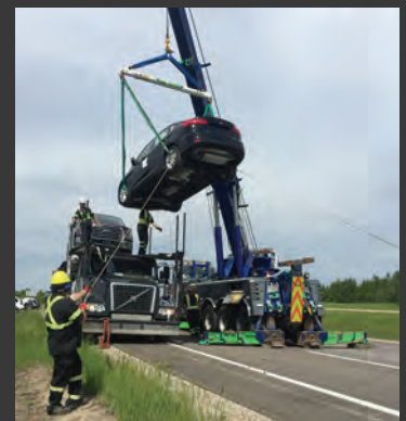
Rotator at its Best