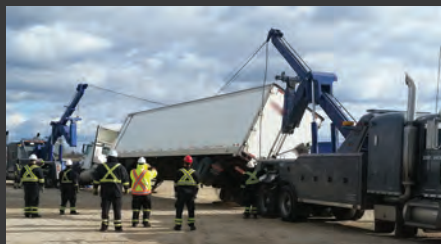
Heavy Upright Training