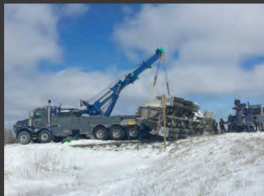
Loaded Concrete Tanker Recovery