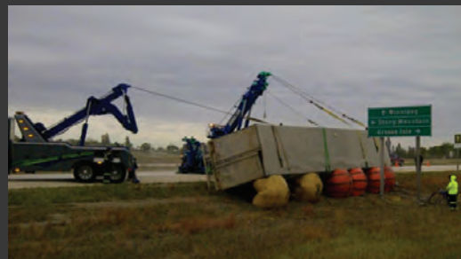
Uprighting Trailer Full of Manitoba Walleye