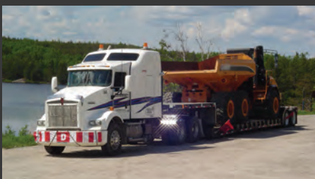
Equipment Transport Division