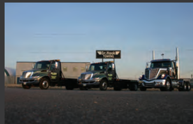
Tilt Deck Division Units