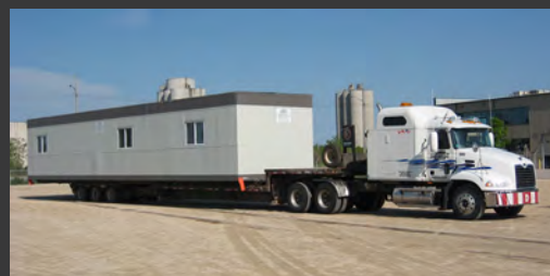
Modular Space Unit Transport