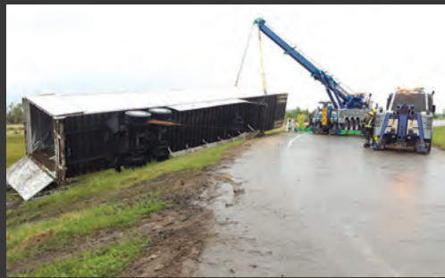
Exit Ramp Tractor Trailer Recovery