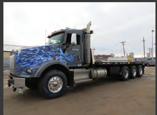
Tri Drive Tilt Deck