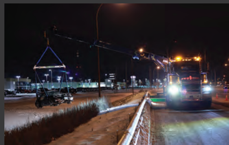
Porsche Rotator Recovery