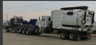
Heavy Tow of Vac Truck