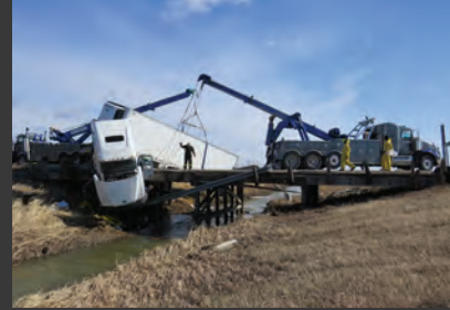
Spill Responce and Heavy Recovery