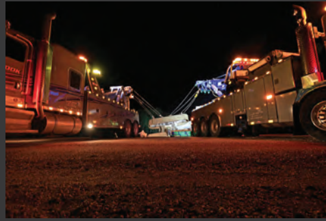
90,000 Lb. Excavator Recovery