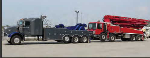
Heavy Tow of 5 Axle Concrete Pumper