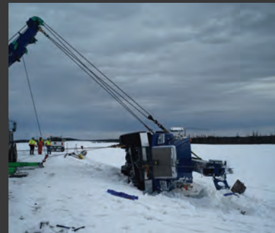
Winter Road 5 Axle Crane Recovery