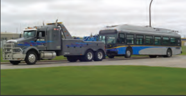
Electric Trolley Bus Tow