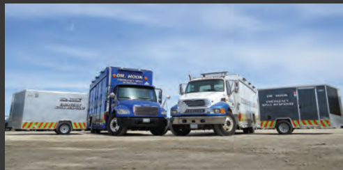
Spill Response Units