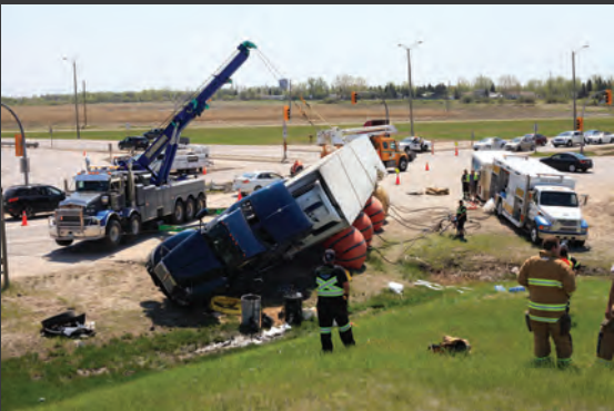
Air Cushion, Spill Response for Loaded Truck and Trailer