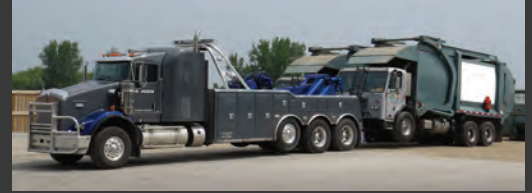
Heavy Tow of Garbage Truck