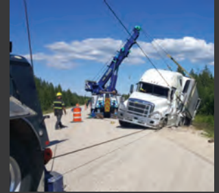
Tractor and 2 Loaded Trailers Air Cushion Uprighting