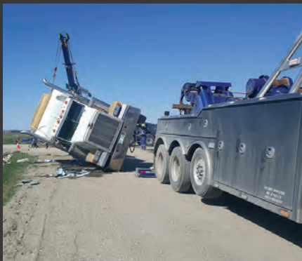
Over Turned Gravel Truck and Trailer