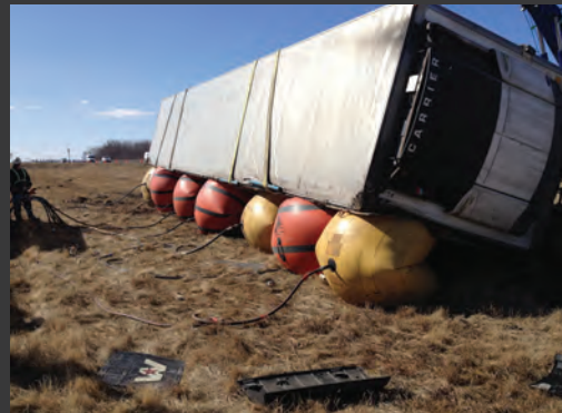
Air Cushion, Upright Loaded Trailer of Pork