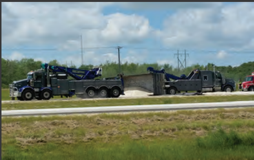
Upright Overturned Gravel Truck and Trailer