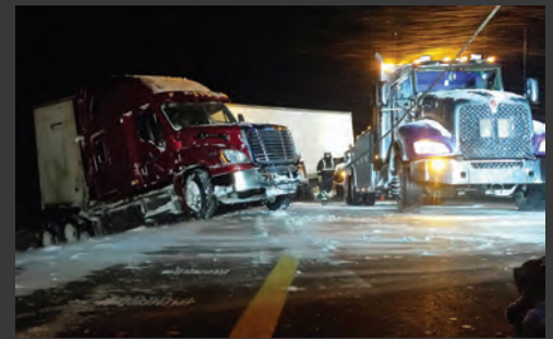
Jack Knife Storm Recovery