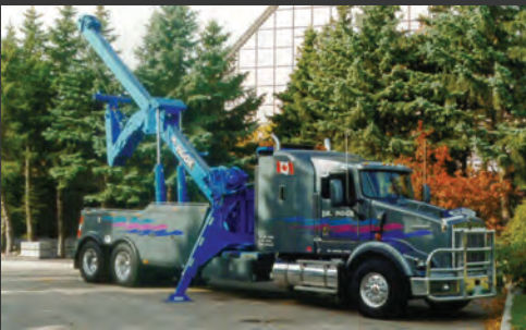
50 Ton Side Puller