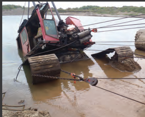
Rigging for the Load