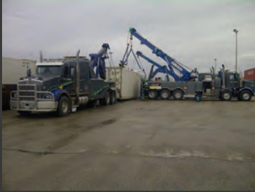
Sea Container Lift 3 Wreckers