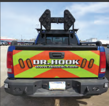
Traffic Control Unit