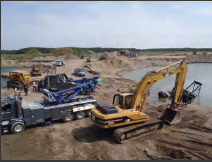
90,000 Lb. Dragline Recovery From Gravel Pit