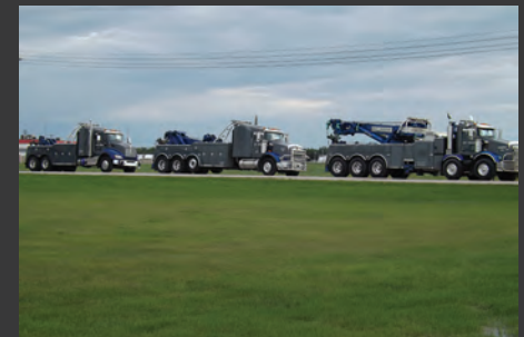
Special Olympics Truck Convoy