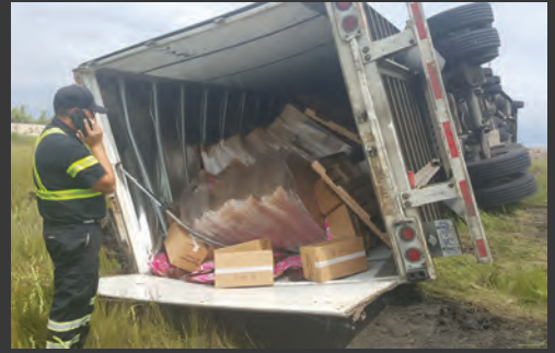
Cargo Off Loading