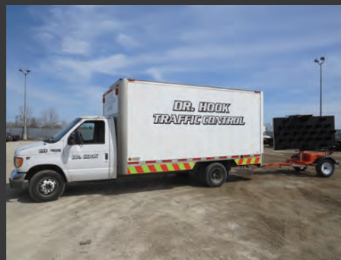
Traffic Control Unit