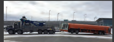
Rotator Super Tanker Tow