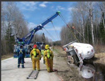
LPG Tanker Recovery