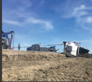
Side Dump Trailer Overturned