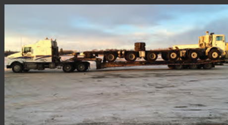
Tilt Trailer Transport