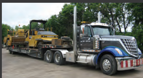
Tilt Trailer Transport