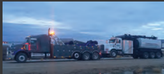
Heavy Tow of Tri Drive Vac Truck