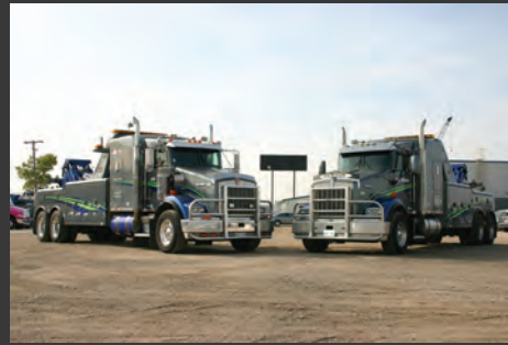
2 Of 13 Heavy Tow Units