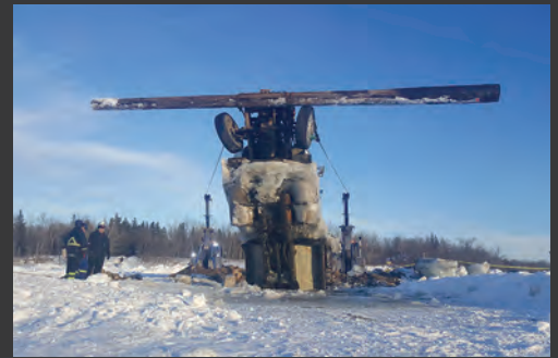
Winter Road Lake Recovery