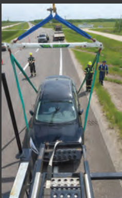
Auto Carrier off Load