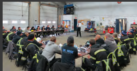
WreckMaster Class Room Training