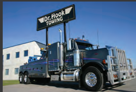
Heavy Tow Unit #6