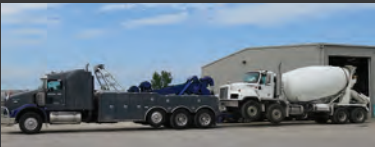
Heavy Tow of Tandem Mixer