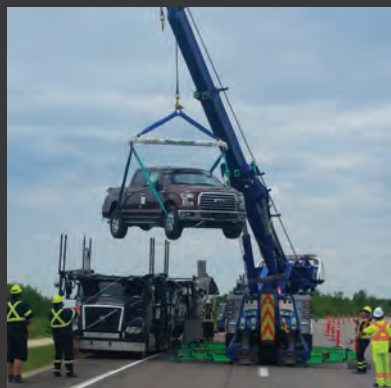
Auto Carrier off Load