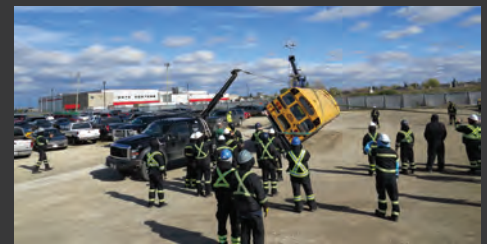
WreckMaster Upright Training